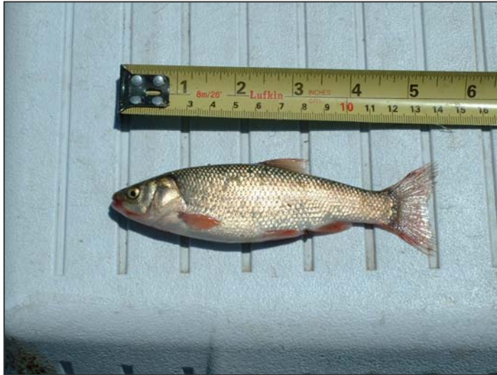
Tui chub collected from tern colony

Diet Composition: A large number of Caspian tern bill loads were successfully identified at the Keister Island nesting platform (N = 1,378). The diet of Caspian terns nesting at Keister Island consisted primarily of Tui chub (Cyprinidae), followed by sunfish