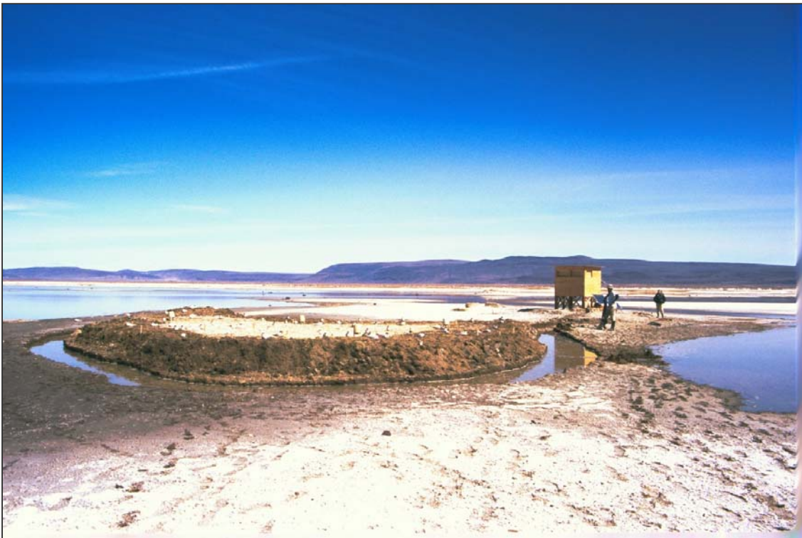
Construction of Shovel Island, 2003

During the 2002 breeding season, one pair of Caspian terns attempted to nest on a small push-up in East Link Impoundment, but the nesting attempt failed. This was the only known nesting attempt by Caspian terns in the Summer Lake area during 2002. Prior to the arrival of Caspian terns to the Summer Lake area in spring of 2003, East Link Impoundment was nearly dry. After improvements were made to Shovel Island with hand tools and straw bails were placed around the island to protect it from wave erosion, ODFW staff diverted water to East Link Impoundment, creating the island. An observation blind was built on a nearby push-up, and 60 Caspian tern decoys and 2 audio playback systems were deployed on Shovel Island. Following a severe rainstorm on May 29, we discovered that the substrate on Shovel Island had become mucky and unsuitable for tern nesting. On June 12, we placed 10 small piles of crushed gravel on the island (see below).