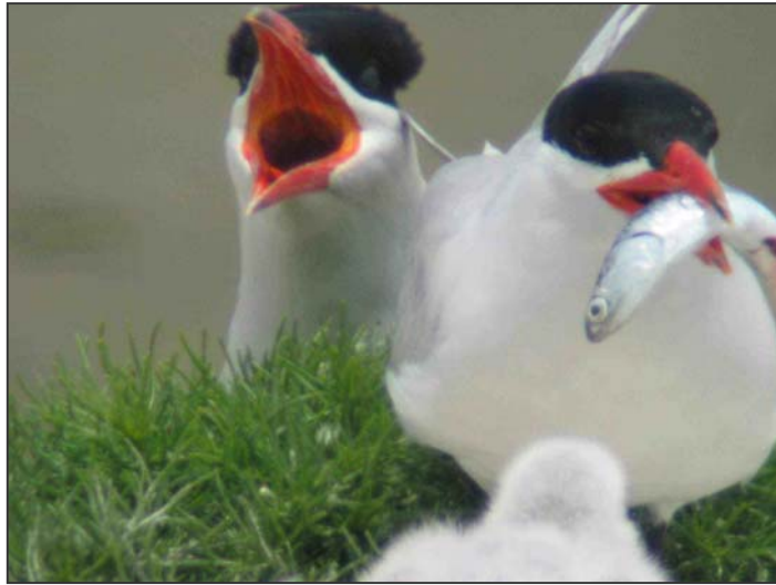
Adult tern with anchovy in bill

Diet Composition: A small number of Caspian tern bill loads were identified at the A-7 Pond colony (N = 90), due to the small size of the colony and the distance between the levee and the colony (> 300 m). Based on this small sample size, the diet of Caspian terns nesting at A-7 Pond included toadfish (Batrachoididae), sculpins (Cottidae), gobies (Gobiidae), silversides (Atherinidae), surfperch (Embiotocidae), and anchovies (Engraulidae), in that order (Table 12). Each of these prey types represented greater than 10% of the diet. Additional fish taxa that represented more than 1% but less than 10% of the identified diet included flatfish (Pleuronectidae), sunfish (Centrarchidae), and juvenile sharks (Carcharhinidae). There were no salmonids observed among the identified bill loads at A-7 Pond in 2003.