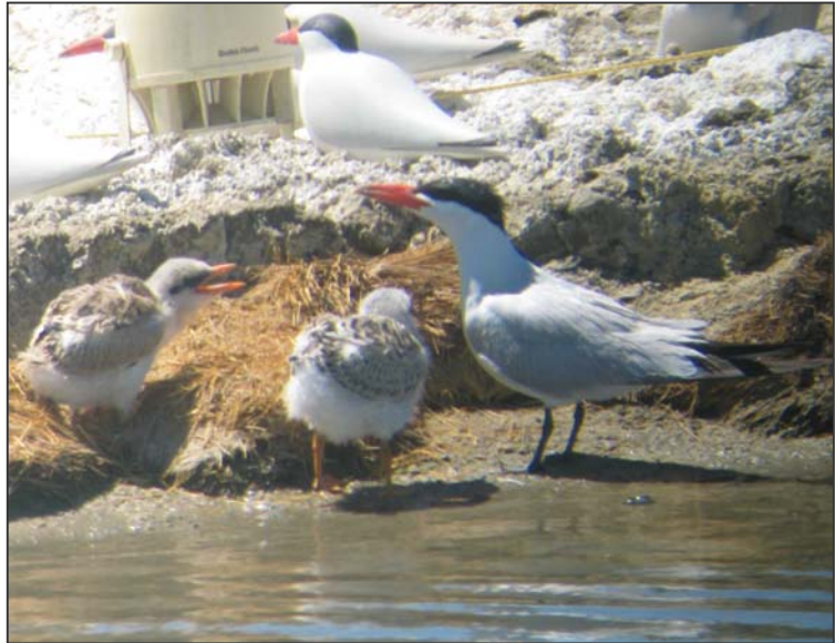
Two chicks that were successfully raised on Shovel Island, 2003

Two young terns fledged from the Shovel Island colony in 2003, or an average of 0.40 young raised per breeding pair (Table 17). This level of productivity is considered low compared to other well-studied colonies in the Pacific Region, and similar to levels observed at Rice Island in the Columbia River estuary, prior to the relocation of the colony to East Sand Island.