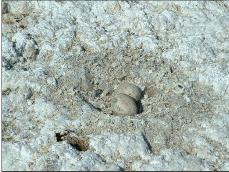
Tern eggs stuck in mud on Shovel Island, 2003

The most apparent factors limiting colony size and nesting success of Caspian terns on Shovel Island were the (1) quality of nesting substrate and (2) availability of nesting habitat (Table 16). Capillary action by the fine-grained materials comprising Shovel Island, coupled with the heavy rainfall on May 29, saturated the substrate on Shovel Island, which consisted of muck from the bottom of the impoundment.