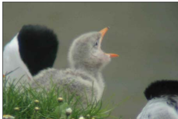
Young tern chick on Brooks Island, 2003

Colony Size and Nesting Success: Brooks Island was the first site in the San Francisco Bay area where Caspian tern nesting activity was recorded in 2003. The first Caspian tern egg was laid on the Brooks Island colony on April 17, and chicks began hatching on May 13 (Table 1). The first fledgling (young capable of flight) was observed on June 20. Nesting habitat near the observation blind was occupied first (Main Sub-colony), and later a separate satellite sub-colony was formed further down the beach to the northwest (NW Satellite). Most of the Main Sub-colony could be observed and numbers of adult terns counted from the observation blind, but some nesting adults were obscured by vegetation or topography. The NW