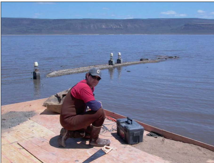
Construction of Keister Island nesting platform with flooded island in background

Prior to the arrival of Caspian terns in the Crump Lake area this year, Keister Island had emerged from Crump Lake, exposing about 200 m 2 of suitable sand and gravel nesting habitat for Caspian terns. After improvements were made to the tern nesting habitat with