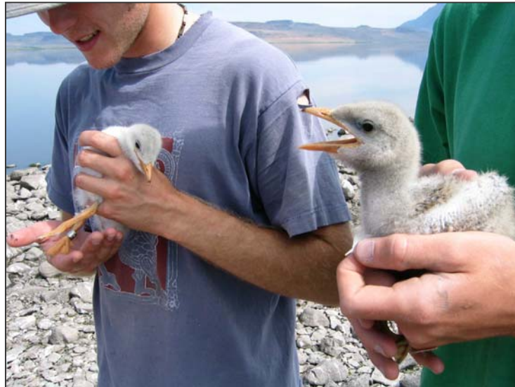
Chick banding at Keister Island, 2003

Chick Banding and Resightings of Banded Adults: On July 24, 31 tern chicks near fledging age were banded with USGS numbered metal leg bands and a unique color combination of plastic leg bands, and an additional 14 younger chicks were banded with numbered metal leg bands only. These marked individuals will allow us to measure survival rates and movements among colonies.