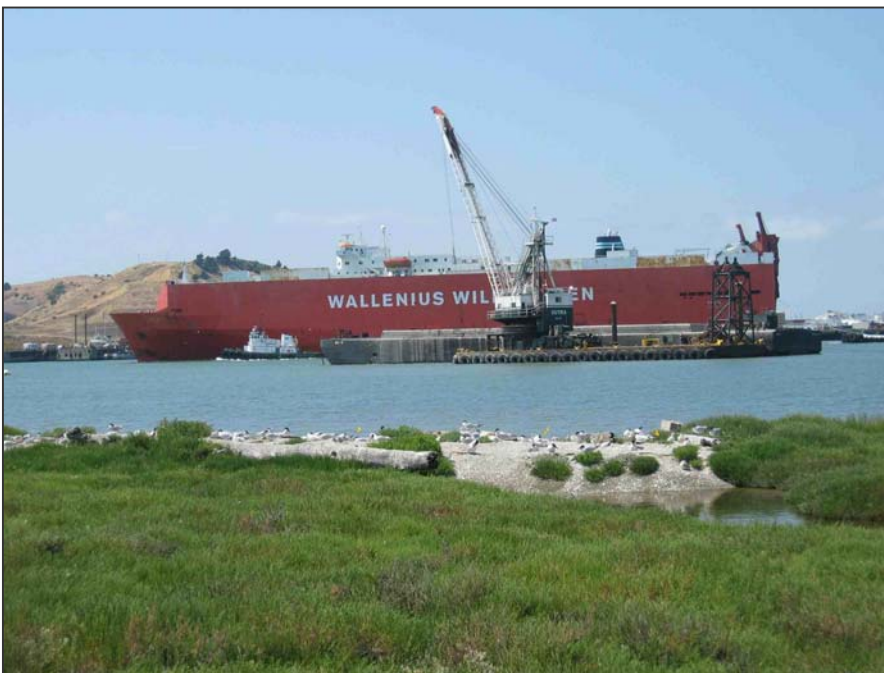
Shipping traffic near Brooks Island tern colony, 2003

Factors Limiting Colony Size and Nesting Success: The primary factors limiting the size and productivity of the Brooks Island Caspian tern colony appeared to be (1) availability of suitable nesting habitat and (2) human disturbance (Table 16). Nesting habitat for terns