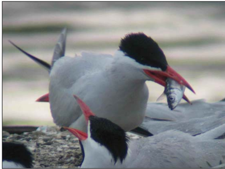
Adult tern with herring in bill

Diet Composition: A total of 835 bill load fish were identified at the South Colony on Knight Island. The diet of Caspian terns nesting at Knight Island was dominated by silversides (Atherinidae), followed by surfperch (Embiotocidae), sunfish (Centrarchidae), and gobies (Gobiidae), in that order (Table 10). Each of these four prey types represented greater than 10% of identified prey items. Additional fish taxa that represented more than 1% but less than 10% of identified prey items included salmon (Salmonidae), herring (Clupeidae), anchovies (Engraulidae), toadfish (Batrachoididae), sculpins (Cottidae), and trout (Salmonidae), in that order. Three other prey taxa each represented less than 1% of the diet. Salmon represented 8.7% of identified prey items and consisted of juvenile chinook salmon, a listed species. The Knight Island Caspian tern colony had the highest proportion of salmon in the diet of the five tern colonies studied in the San Francisco Bay area during 2003.