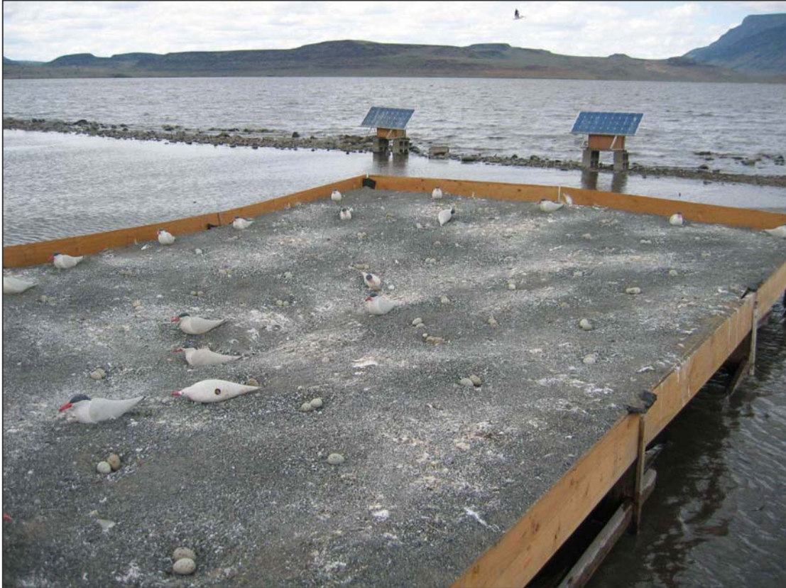
Tern eggs laid on Keister Island Platform, 2003

The next day (May 18), 14 Caspian terns were observed on the nesting platform (Table 8); the first Caspian tern egg was laid on the platform five days later on May 23. Soon thereafter, the continued rise in lake level completely submerged all tern nesting habitat on Keister Island and waves lapped at the underside of the nesting platform. By June 8, there were 49 active Caspian tern nests on the platform, 38 with two-egg clutches and 11 with one-egg clutches. The available nesting habitat on the platform appeared to be