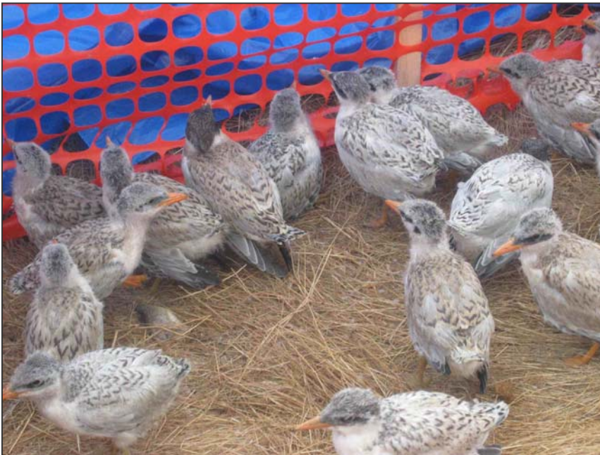
Fledglings captured on Knight Island for banding, 2003

We estimated that approximately 125 young terns fledged from the South Colony at Knight Island, or 0.62 young raised per breeding pair (Table 17). The Northeast Colony at Knight Island nearly failed (only 14 chicks observed at the colony site on June 24) likely due to a combination of encroachment by double-crested cormorants