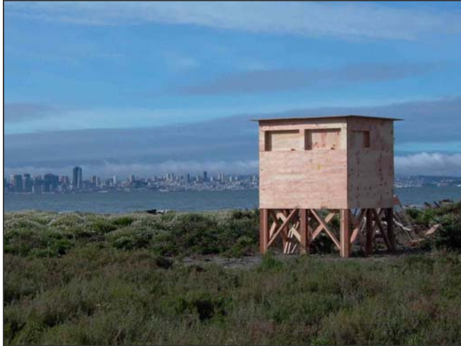
Observation blind on Brooks Island, 2003

In the San Francisco Bay area, the study sites were four existing colonies: Brooks Island, Knight Island, Baumberg Pond, and A7 Pond (Figure 1). The primary study site was on