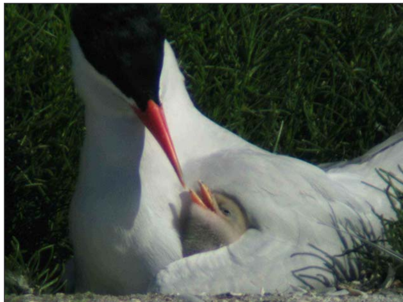
Adult tern with chick

We estimated that approximately 15 young terns fledged from the Baumberg Pond colony, or 0.43 young raised per breeding pair (Table 17). This level of productivity is considered low compared to other well-studied colonies in the Pacific Region, and similar to levels observed at the Rice Island tern colony in the Columbia River estuary prior to relocation of the colony to East Sand Island.