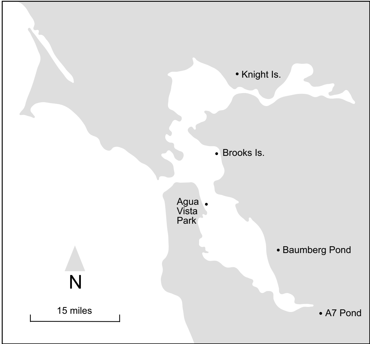
Figure 1. Map of the San Francisco Bay area, showing the locations of known active breeding colonies of Caspian terns during 2003.