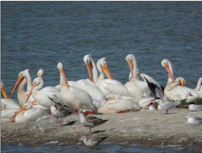
American white pelicans roosting on the Baumberg Pond tern colony, 2003

Factors Limiting Colony Size and Nesting Success: The primary factors limiting the size and productivity of the Baumberg Pond Caspian tern colony appeared to be (1) availability of suitable nesting habitat, (2) quality of nesting substrate, (3) encroachment