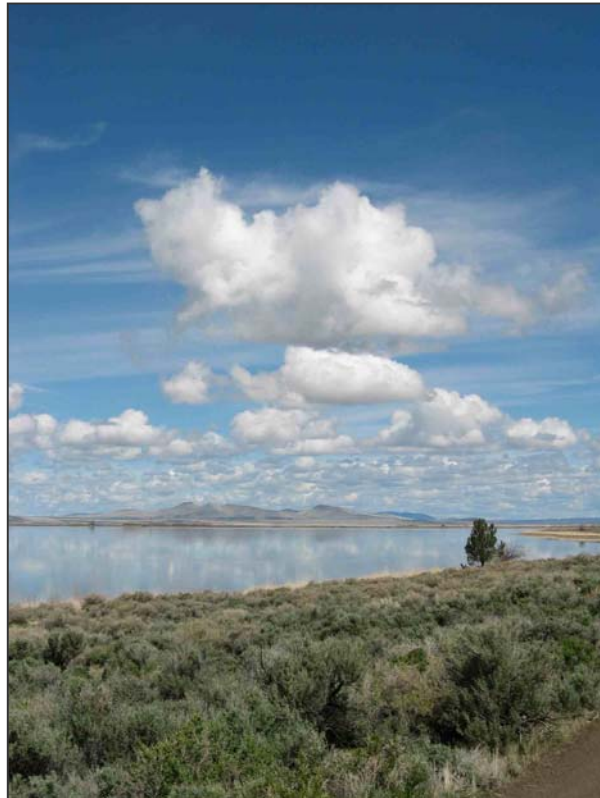
Crump Lake, Warner Valley, Oregon, 2003

Colonies at two historical sites in interior Oregon were studied during the 2003 breeding season: Summer Lake Wildlife Area and Crump Lake (Figure 2). The interior Oregon study sites were selected from among the following three historical colony sites: (1) Summer Lake Wildlife Area, (2) Warner Valley (i.e., Crump and Pelican lakes), and (3) Malheur National Wildlife Refuge (i.e., Malheur Lake; Figure 2). All three of these sites have a recent history of use by nesting Caspian terns (Shuford and Craig 2002, Roby et al. 2003a). Selection of the two study sites in 2003 was based on the relative prospects for tern nesting at each site, as determined by pre-season inspection visits during early March to ascertain water levels and resultant nesting conditions.